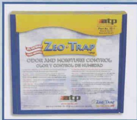
Zeo-Trap ATP Part No. ZE-1 Includes: One – 2 lb. Mesh Pouch