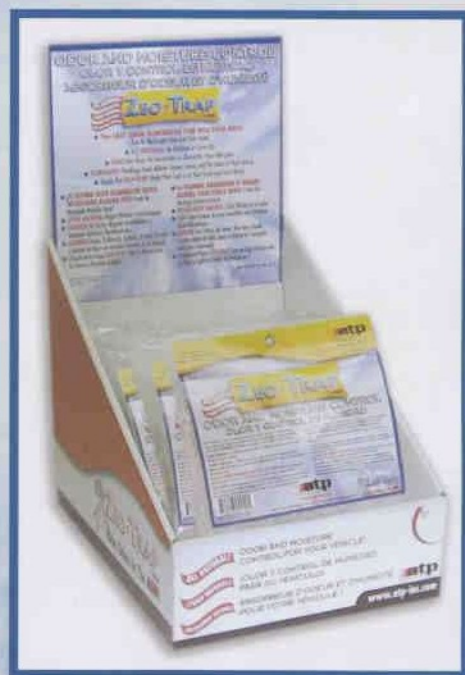
Zeo-Trap Counter Display ATP Part No. A-508

Includes: One Counter Display, Six – 2 lb. Mesh Pouches