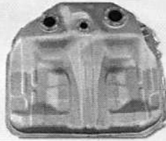
576-857 Toyota Camry, Avalon, ES300 1997-92