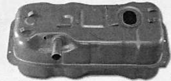
576-723 Mazda B2200, B2600 Pickups 1992-89